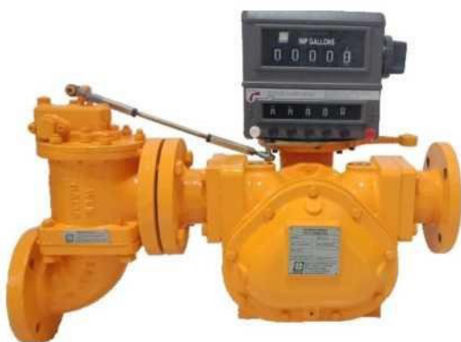
Fig.4: Meter with Mechanical Preset Assembly