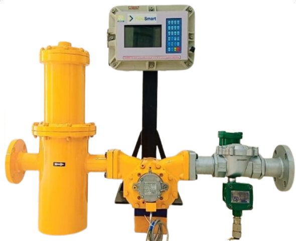
Fig.5: Meter with FlowSmart Batch Controller