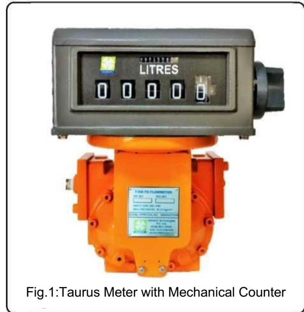
Fig.1:Taurus Meter with Mechanical Counter