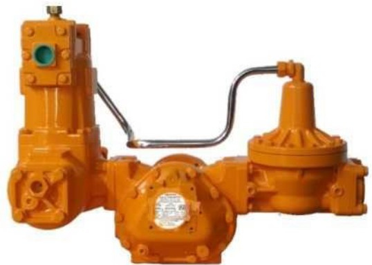
Fig 3. Meter in LPG application