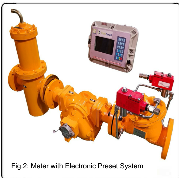
Fig.2: Meter with Electronic Preset System

The Taurus series P. D. flowmeters have a simple and robust design. It consists of a housing and three rotors. The rotors are supported by bearing plates. The calibrator captures the rotor rotation in a calibrated manner and transmits to a counter.